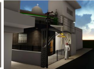
Figure 5. Alternative 1, Design Concept as a Public Sign System