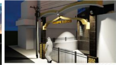
Figure 6. Alternative 2 Perspectives on Archway Design as a Public Sign System