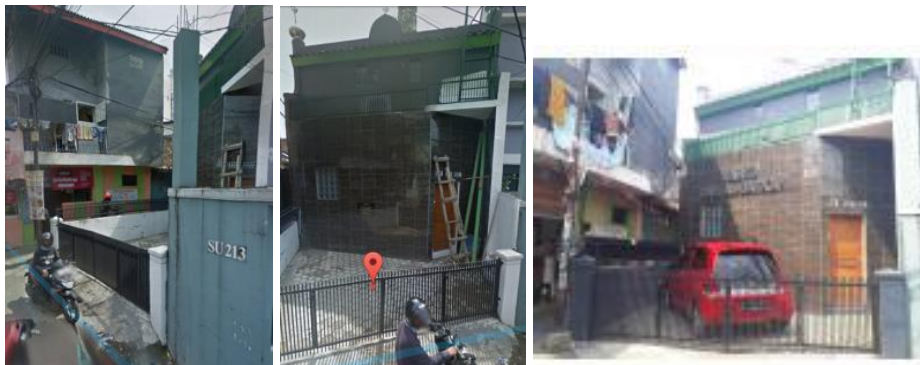
Figure 1.Existing conditions outside the mosque Source: Author survey data, 2019

Partner Issues. Through the process of visits and interviews that have been carried out, it is known that the manager of the mosque and residents around the mosque, need a marker to increase the existence of the mosque and territory.