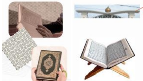
Figure 3. Gapura Design Concept as a Public Sign System

The design of the gate will utilize the form and structure in accordance with the available land area.