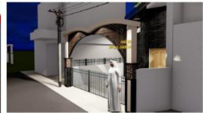
Figure 6. Alternative 3 Perspectives on Archway Design as a Public Sign System