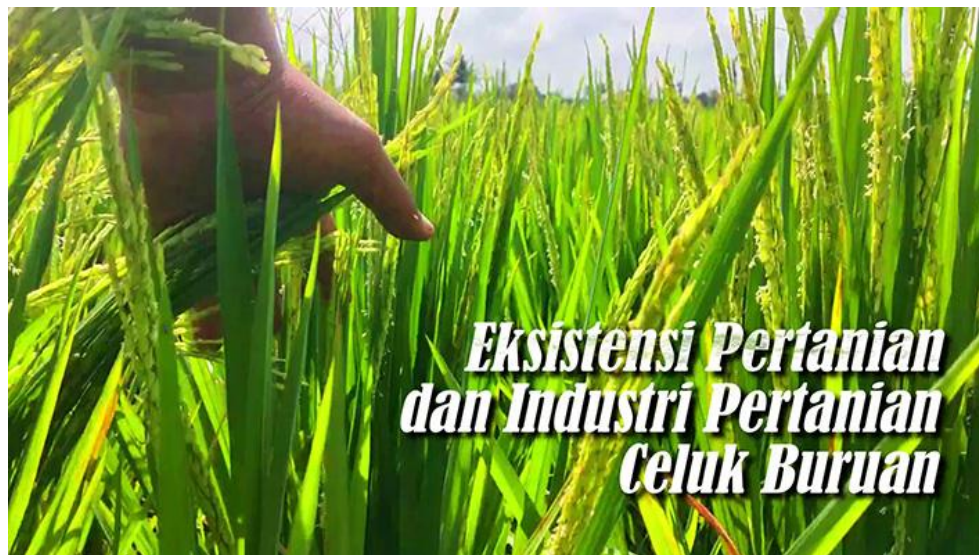
Figure 2. Agricultural and agricultural documentary Celuk Buruan

Basically the documentary presents field facts or real situations that are not engineered (Admin, 2018). The plot of the visualization of the story in this documentary in its initial duration presents the repertoire of cultural traditions in Bali and is followed by agrarian activities in Buruan Village. The presentation is by interviewing farmers who work on productive land in this area. In the initial duration, the irrigation pathways that irrigate the surrounding rice fields and the community's mutual assistance activities are maintained in maintaining the area.