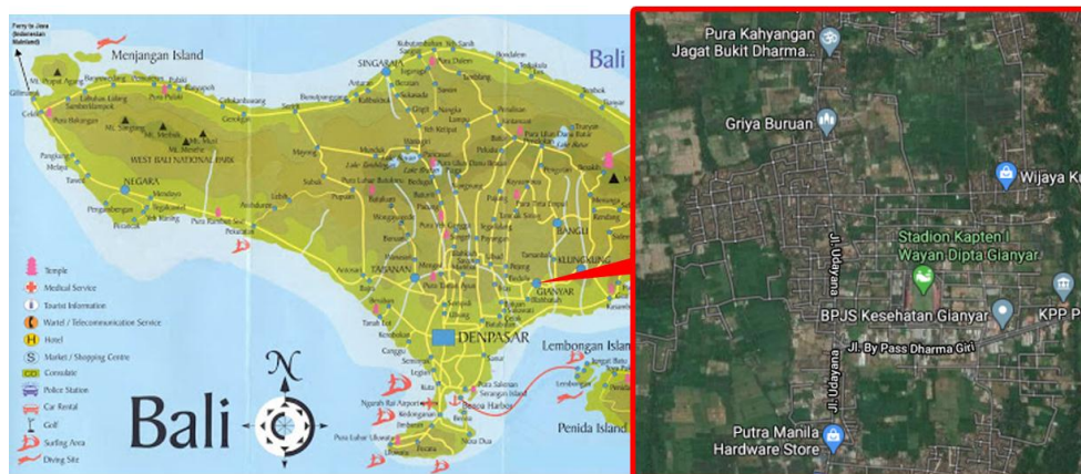
Figure 1. Map of Buruan Village Gianyar Bali

Celuk Buruan Village is located in Gianyar Regency, Blahbatuh District, and this village has an official village structure that oversees seven traditional villages or hamlets or banjars, namely Kutri, Buruan, Celuk, Bangunliman, Getas Kawan, Getas Kangin, and Griya Ketandan (Wikipedia, 2020). The majority of people in the village of Buruan work as farmers because agricultural land in this area can be said to still exist and be productive. Aside from being a farmer, most of the people work as private employees or civil servants, traders, craftsmen and so on.