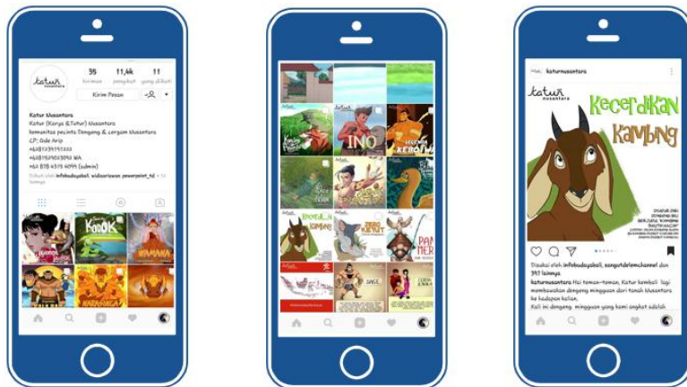
Figure 1. Display of Katur Nusantara's on social media instagram